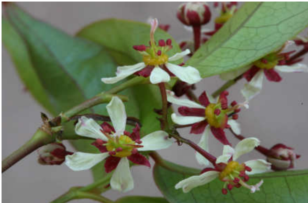
Faber's Maple ( Acer fabri )