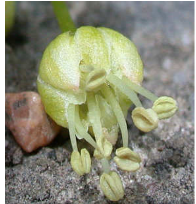
Fire Maple (Acer tataricum)