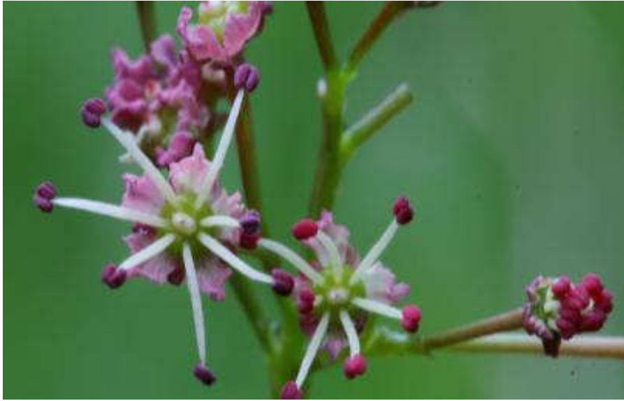
Elegant Maple ( Acer elegantulum ) Spike-leaved Maple ( Acer stachyophyllum )