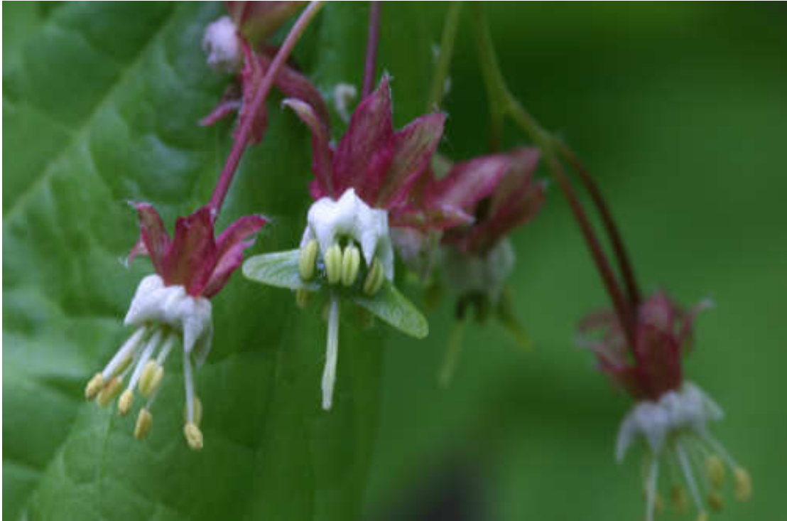
Vine Maple ( Acer circinatum )