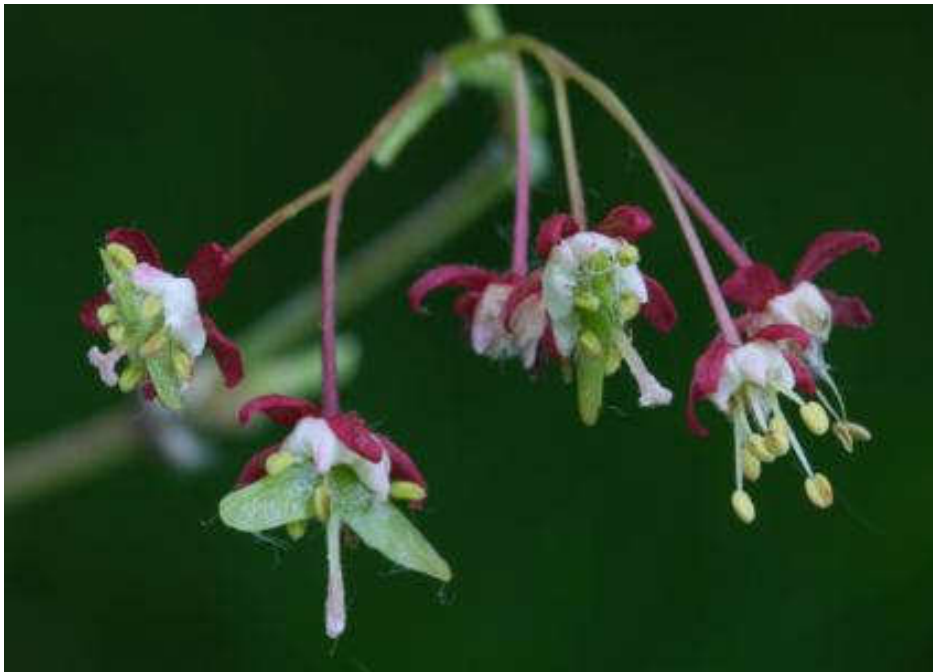
Painted maple ( Acer japonicum )