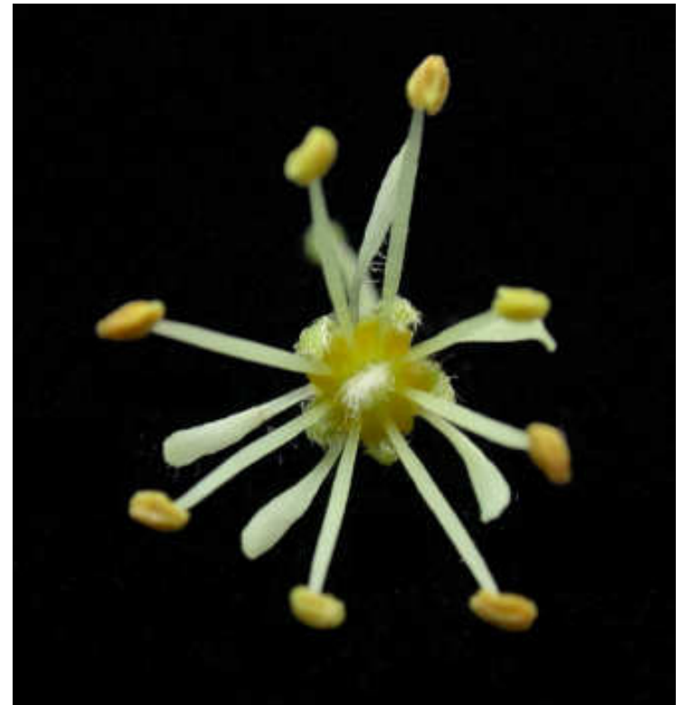
Mountain Maple ( Acer spicatum )