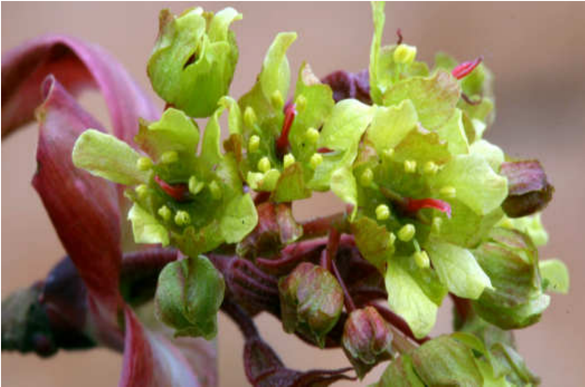
Norway Maple ( Acer platanoides )