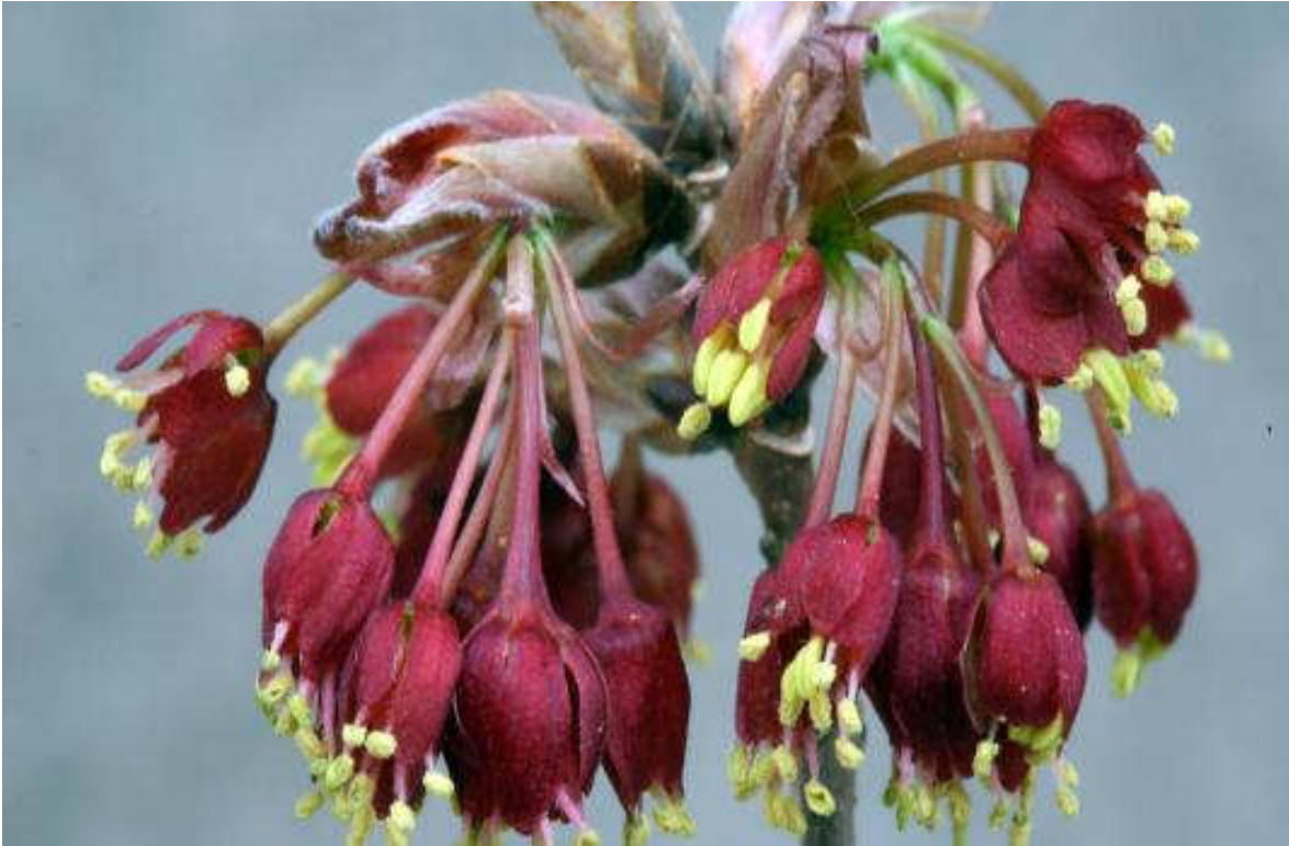
Chinese Purple Maple ( Acer sinopurpurascens )