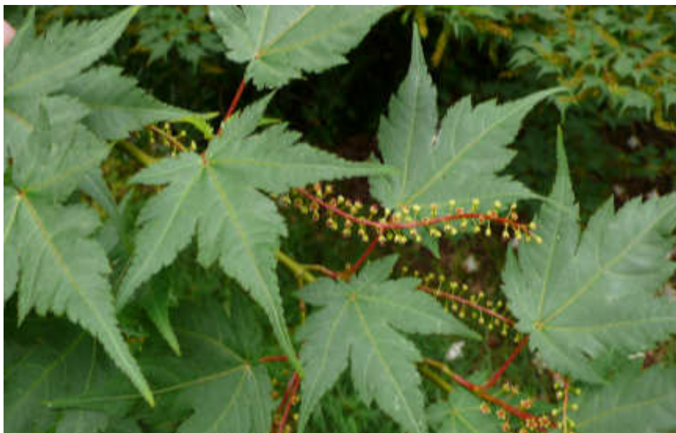
Small-flowered Maple ( Acer micranthum )