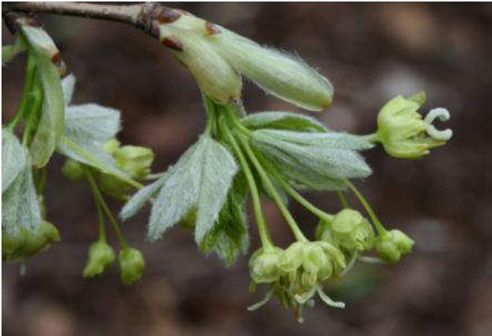
Montpellier Maple ( Acer monspessulanum )