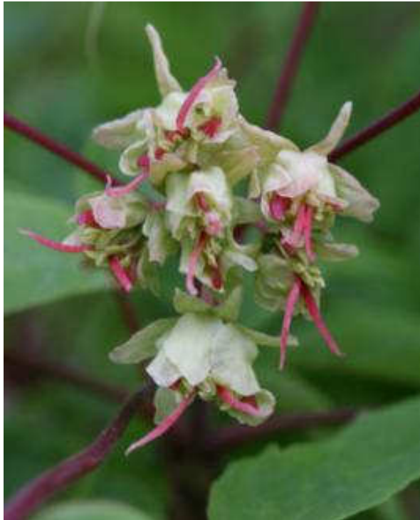
Manchurian Maple ( Acer mandshuricum )