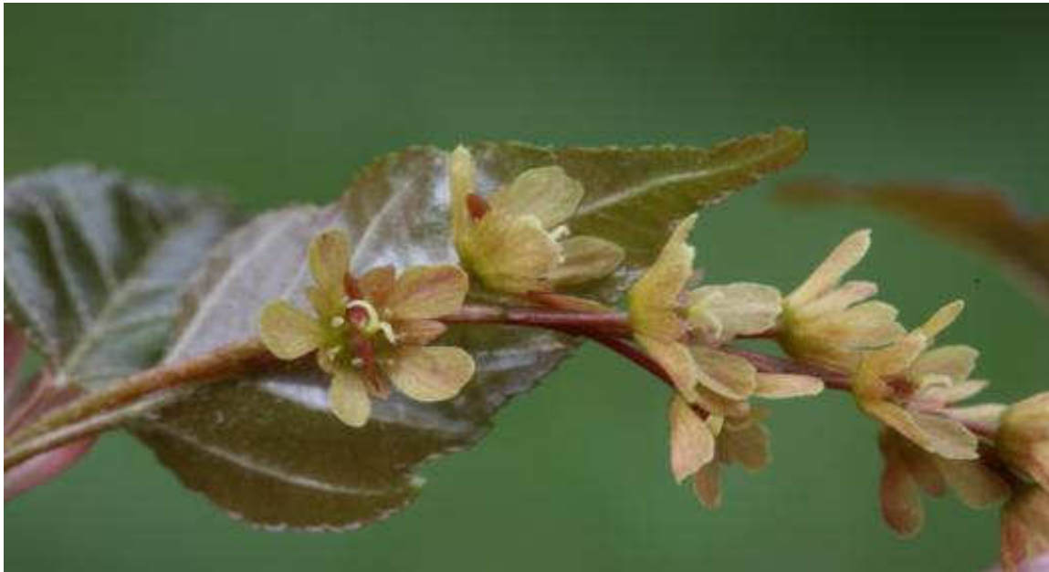
Hawthorn-leaved Maple ( A. crataegifolium )