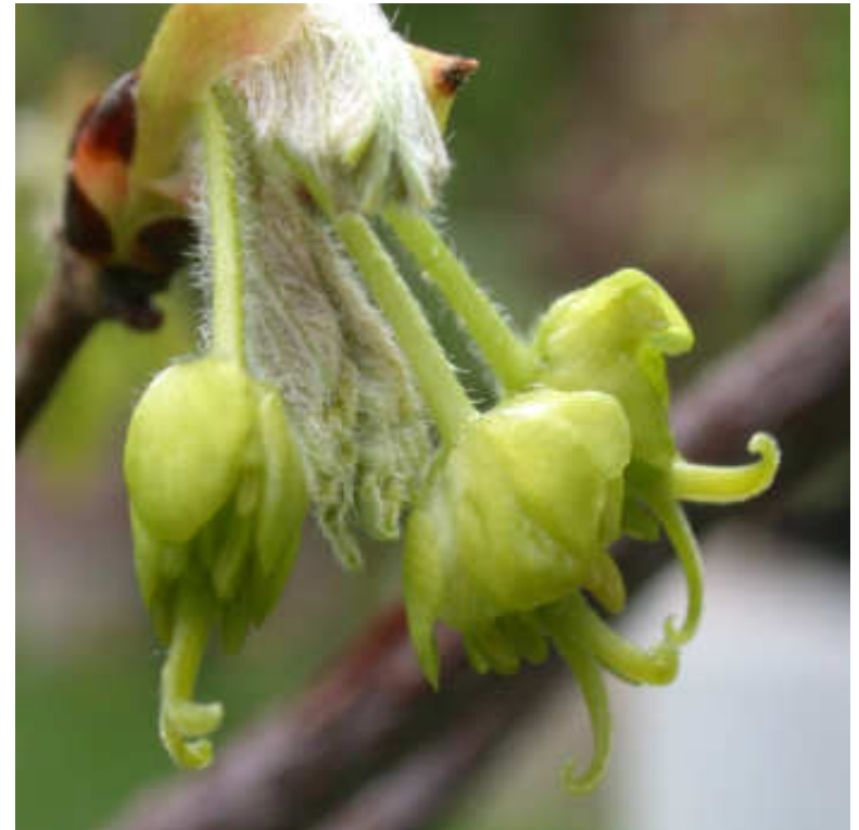
Paper-bark Maple ( Acer griseum )