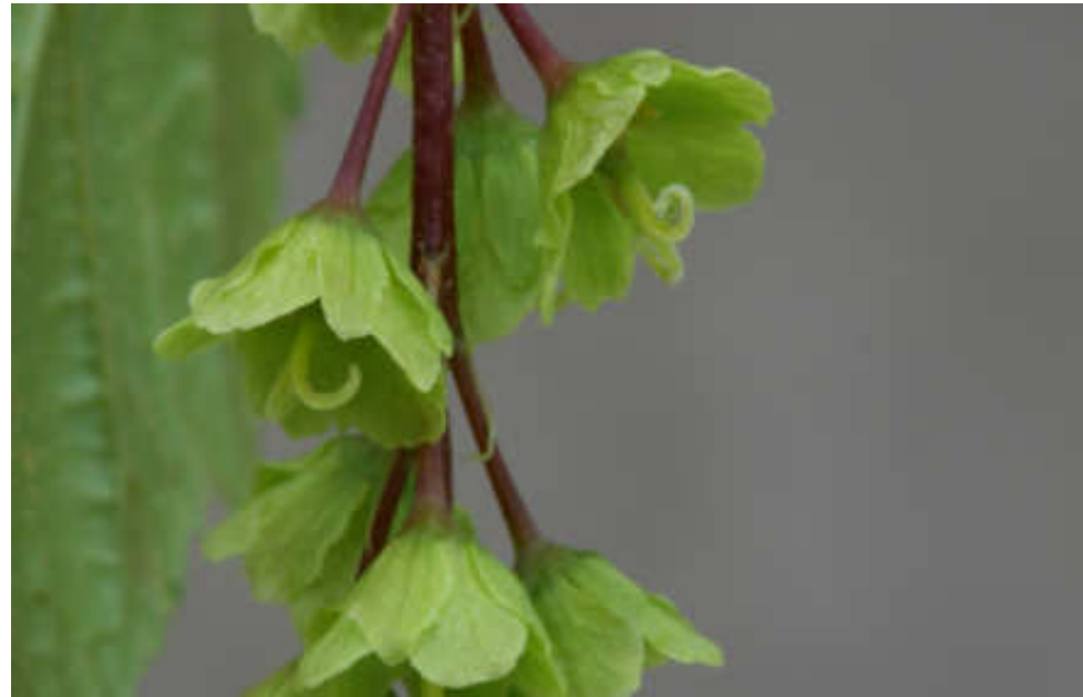
Coated Maple ( Acer tegmentosum )