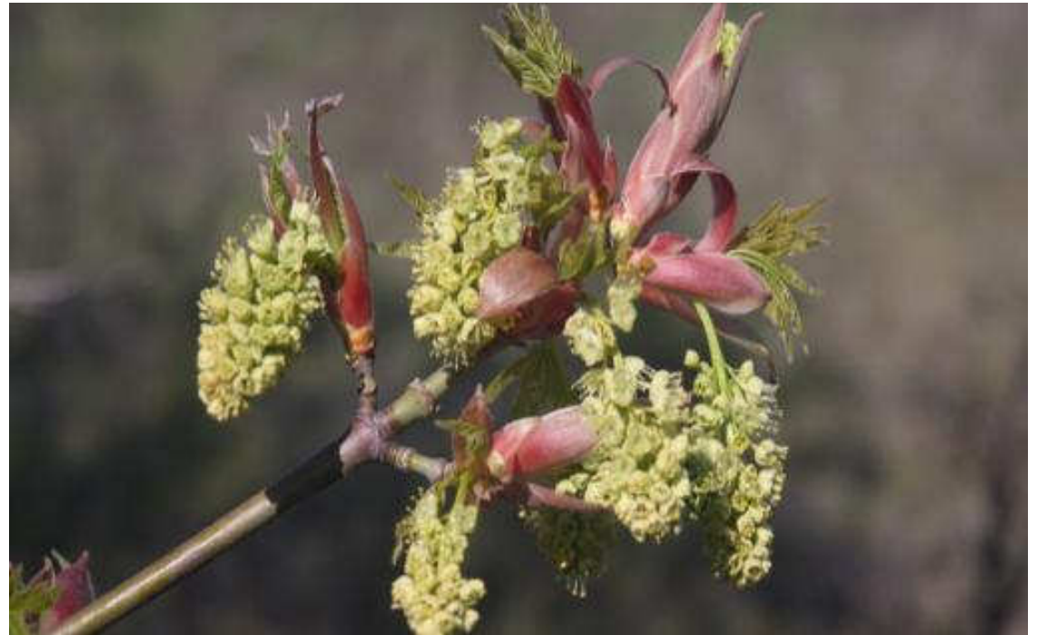
Big-leaf Maple ( Acer macrophyllum )