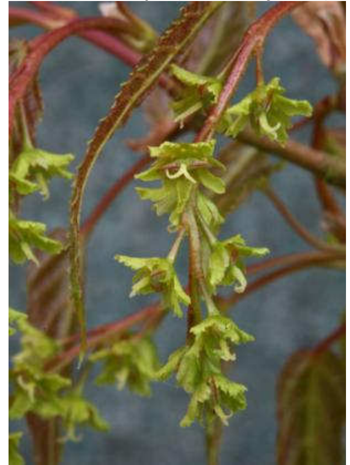
Kawakami Maple ( A. caudatifolium )