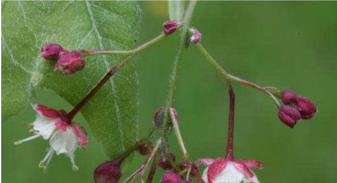
Oliver's Maple ( A. oliverianum )