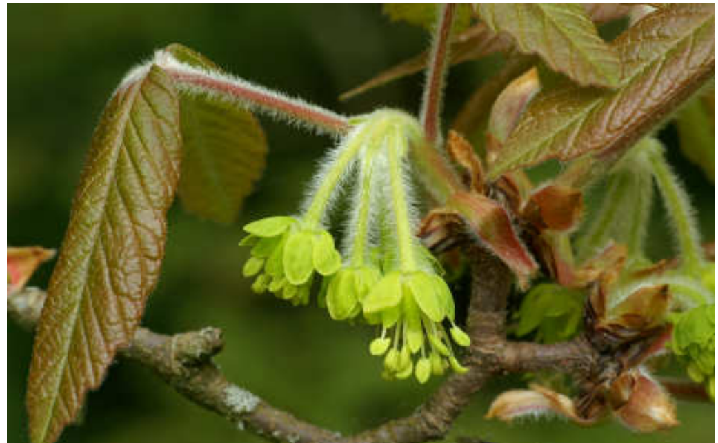
Nikko Maple ( A. maximowiczianum )