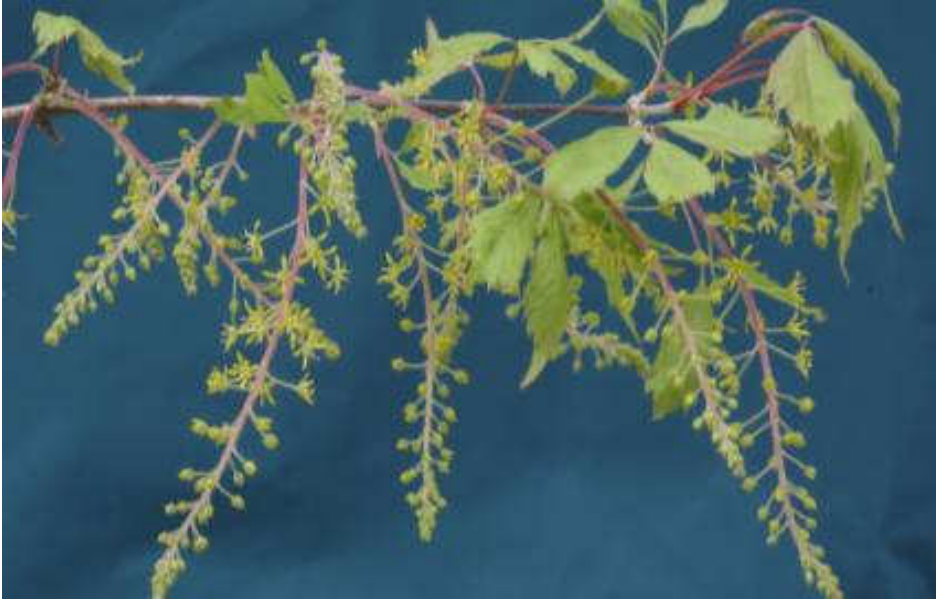
Vine-leaf Maple ( Acer cissifolium )