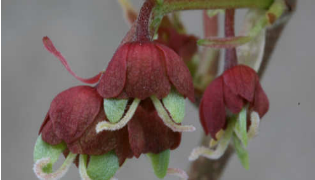
Devil's Maple (Acer diabolicum)