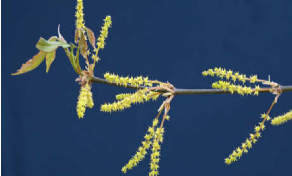
Henry's Maple ( Acer henryii )