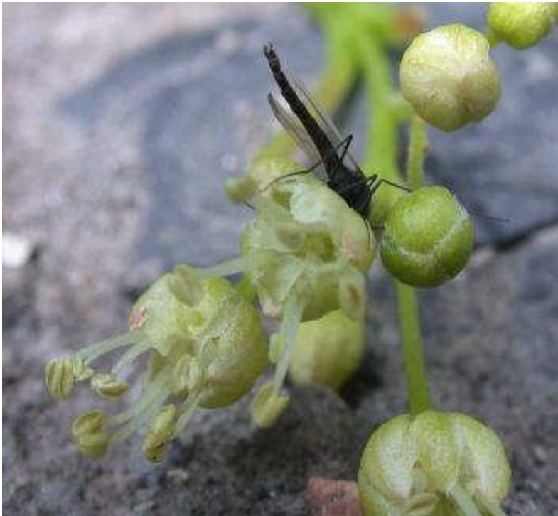
Amur Maple ( Acer tataricum ssp. ginnala )