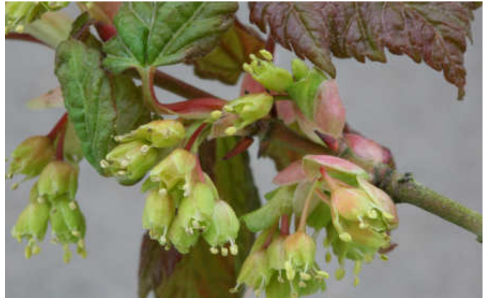
Bearded Maple (Acer barbinerve)