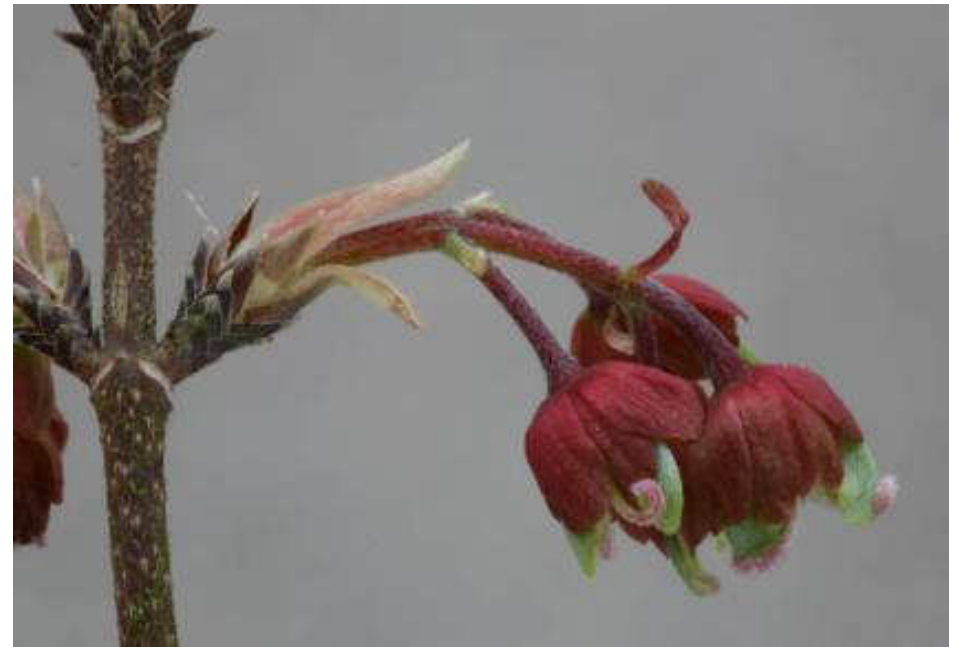
Devil's Maple ( Acer diabolicum )