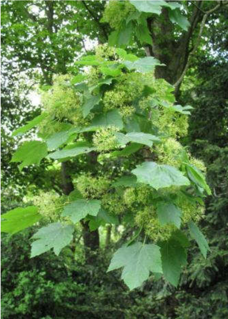
Caucasian Maple ( Acer velutinum )