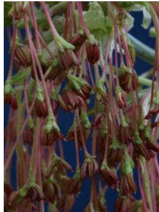
Box Elder ( Acer negundo )