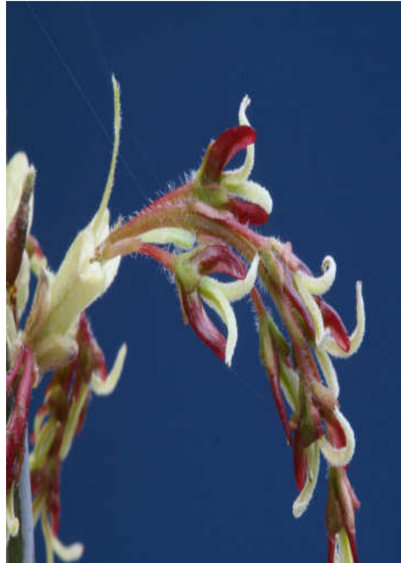
Box Elder ( Acer negundo ) - male & female