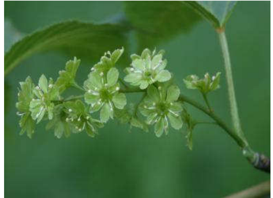
Metcalf's Maple ( Acer sikkimense ssp. metcalfii )