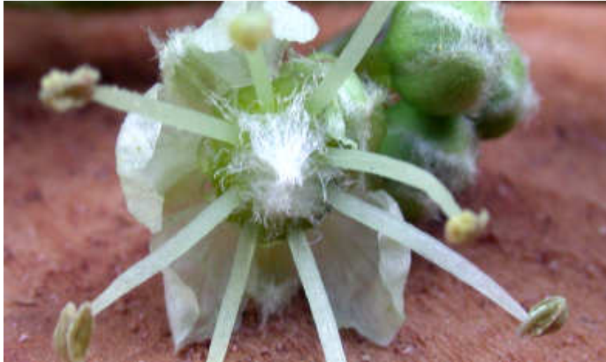
Woolly-flowered Maple ( A. erianthum )