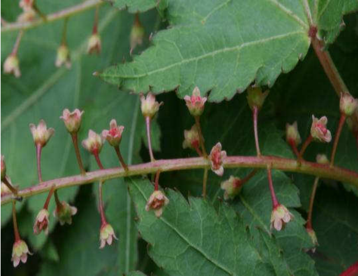
Small-flowered Maple (Acer micranthum)