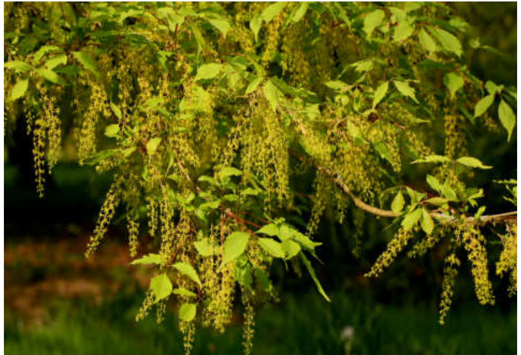
Vine-leaf Maple ( Acer cissifolium )