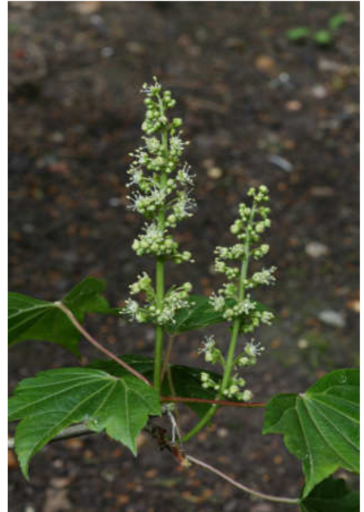
Woolly-flowered Maple ( Acer erianthum )