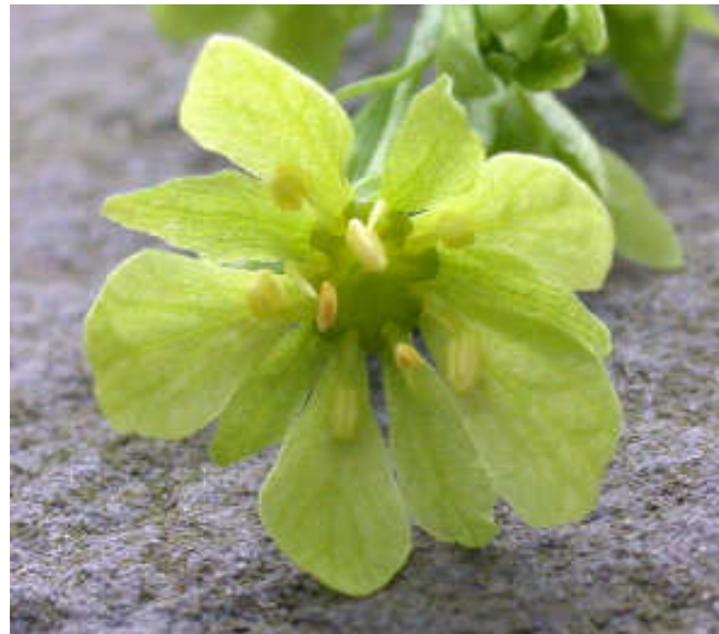
Moosewood ( Acer pensylvanicum )