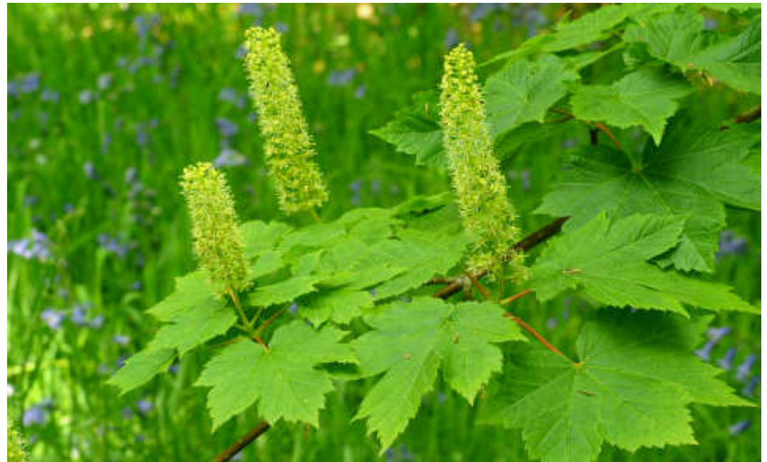
Amur maple ( Acer caudatum ssp. ukurunduense )