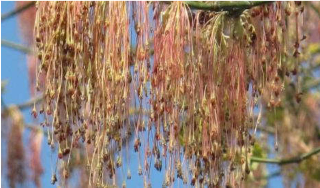
Box Elder ( A. negundo )