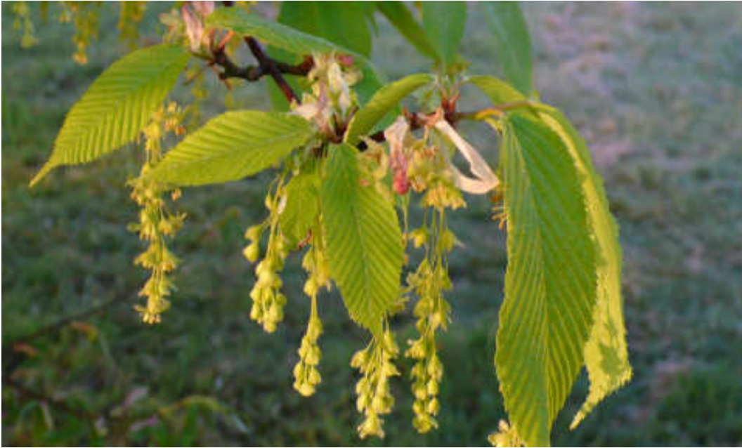
Hornbeam-leaved Maple (Acer carpinifolium)