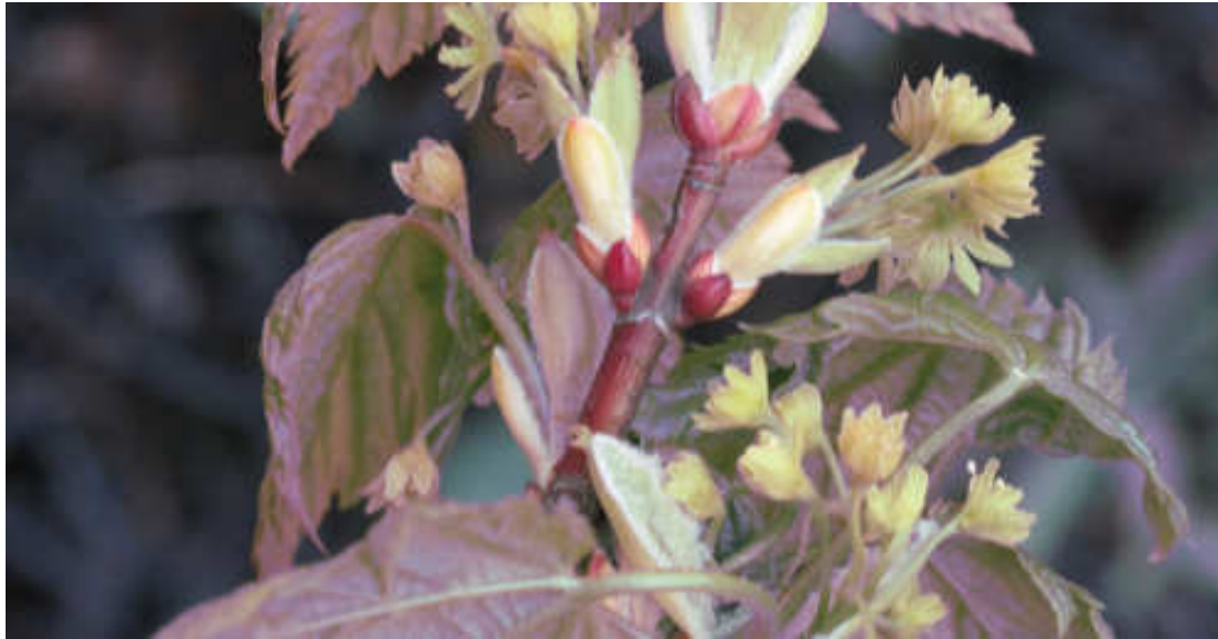
Rocky Mountain Maple (Acer glabrum ssp. douglasii)