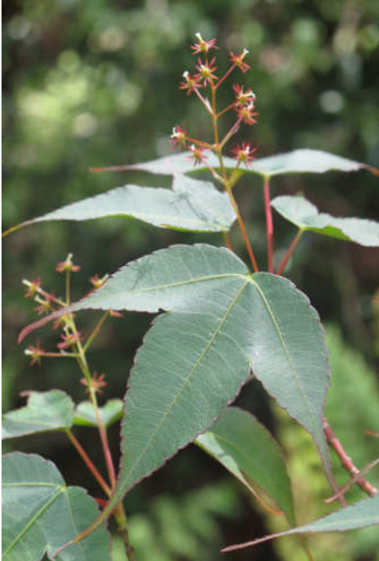
Ward's Maple ( Acer wardii )