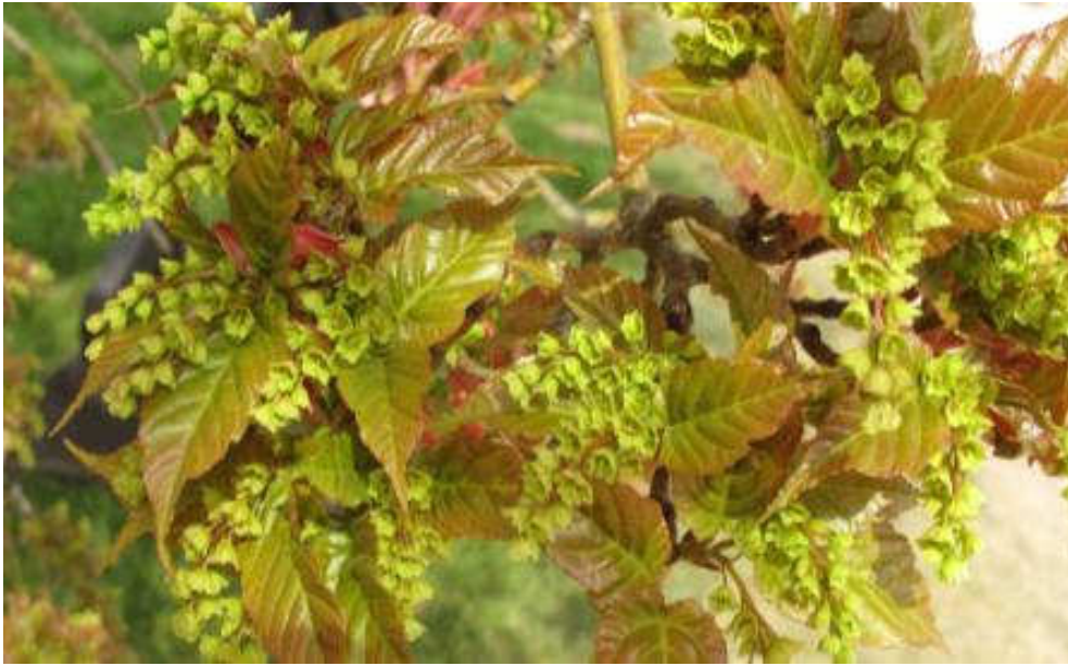
David's Maple ( Acer davidii )