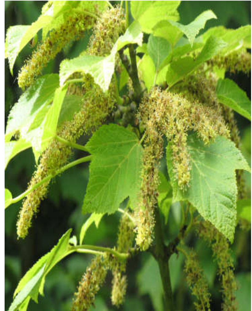
Nippon maple ( Acer nipponicum ) - above & top left