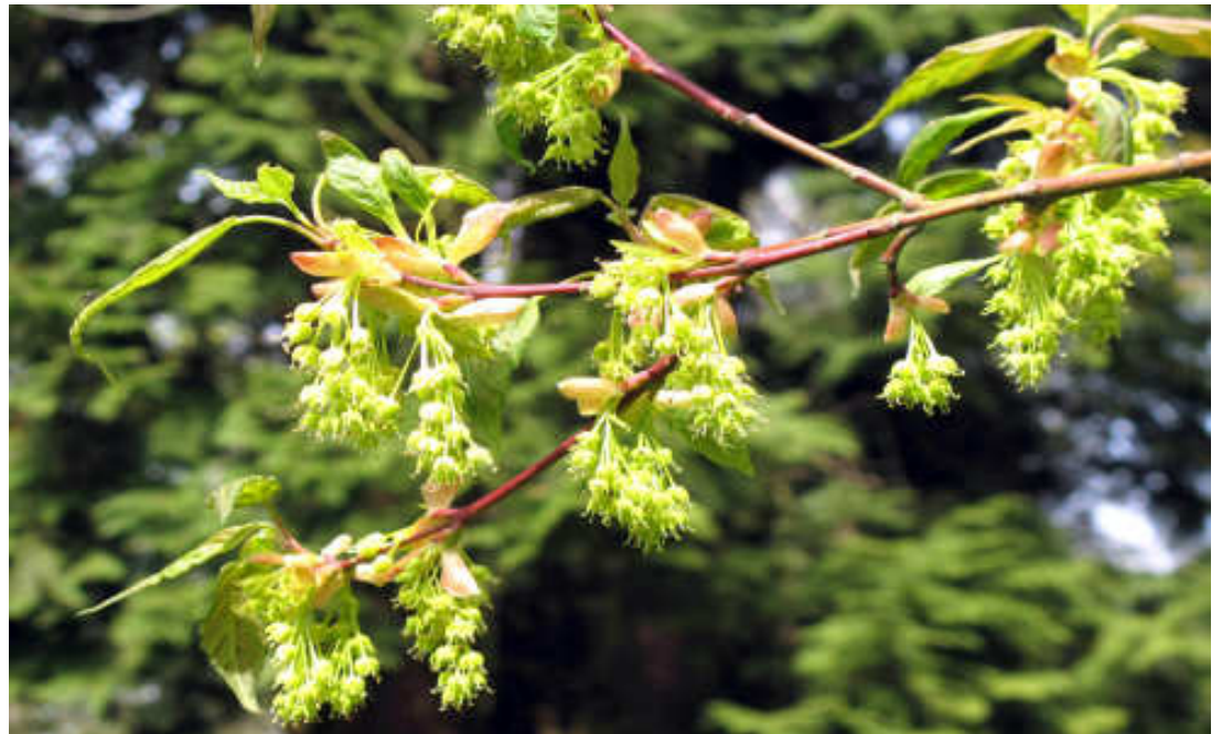
Birch-leaf Maple (Acer stachyophyllum)