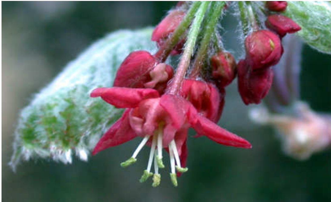
Painted Maple ( Acer japonicum )